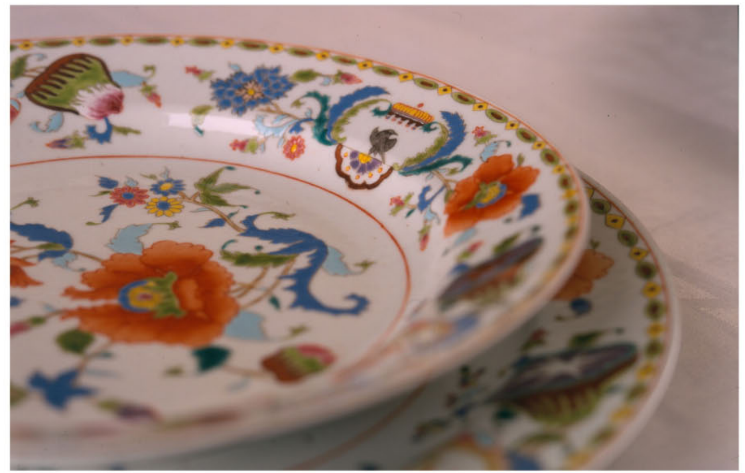
Pompadour dessert bowl and plate

Once the design of your service is approved and your order placed, de Gournay will produce as many sample pieces as required to approve custom colour changes, specific colour requests, the glaze colour and the finish chosen before starting work on crafting the service itself. de Gournay's expertise allows clients to specify a range of finish options to achieve either a contemporary or a convincing antique feel or any option between these two. A typical service might take 16 weeks to decorate once the design is agreed upon.