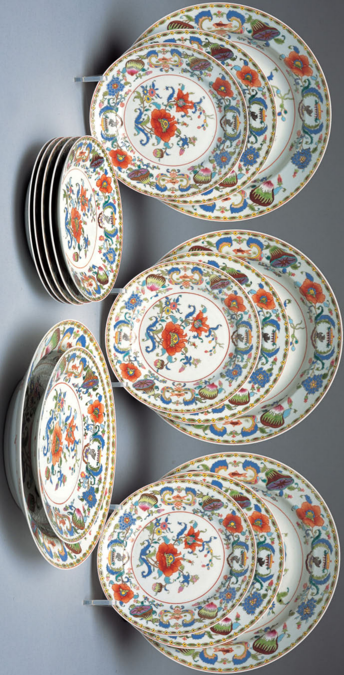
Pompadour service comprising of dinner plates, salad plates, dessert plates, side plates, soup bowls and dessert bowls