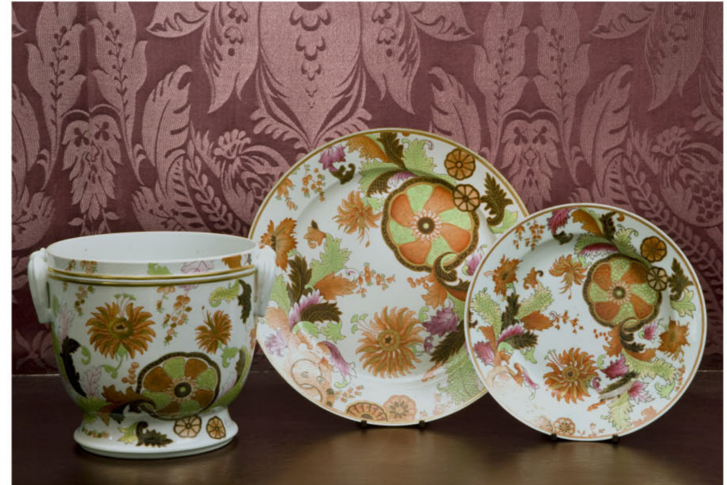
Pseudo Tobacco Leaf wine cooler, dinner plate & soup bowl

The image below shows some of the pieces that resulted from the design drawings illustrated opposite.