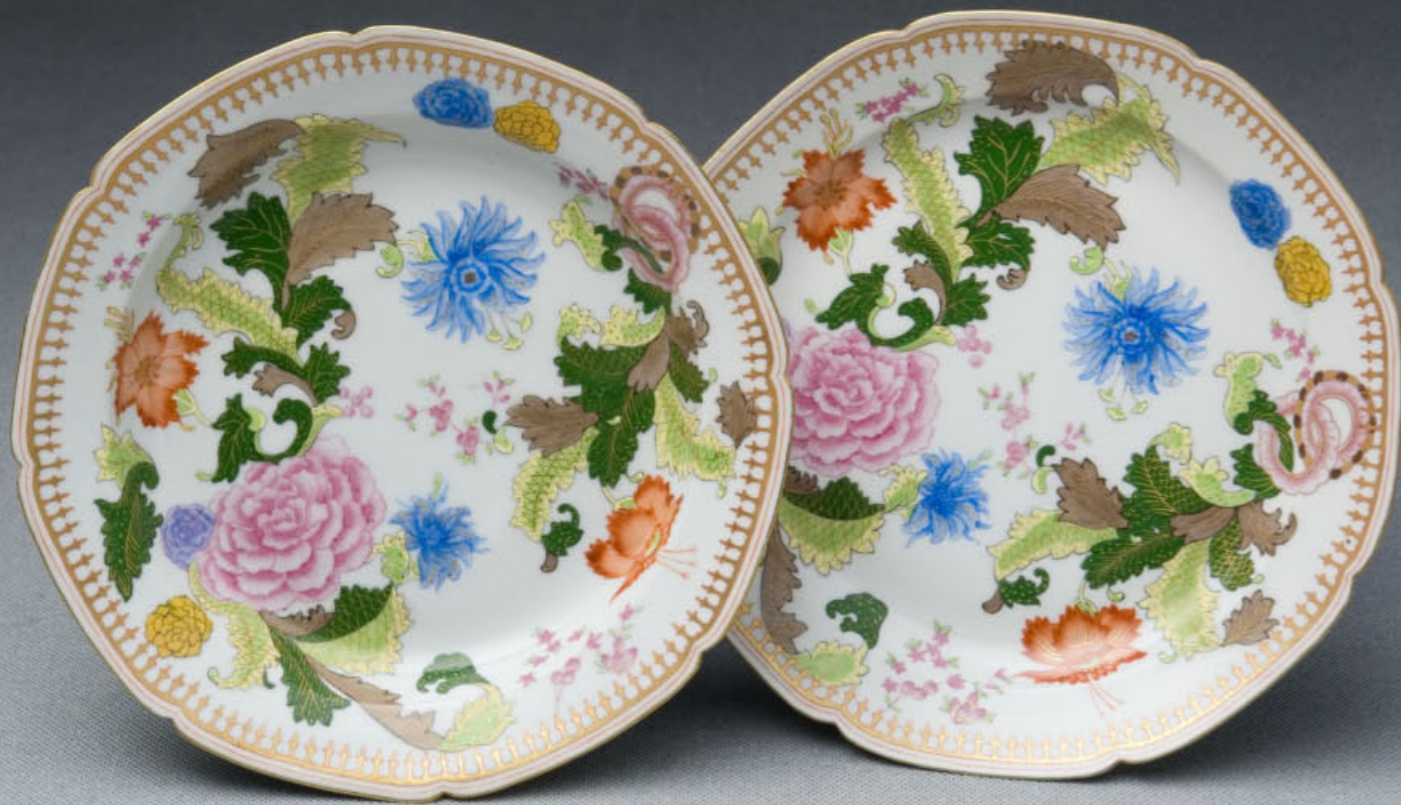
Pseudo Tobacco Leaf dessert service in custom colours