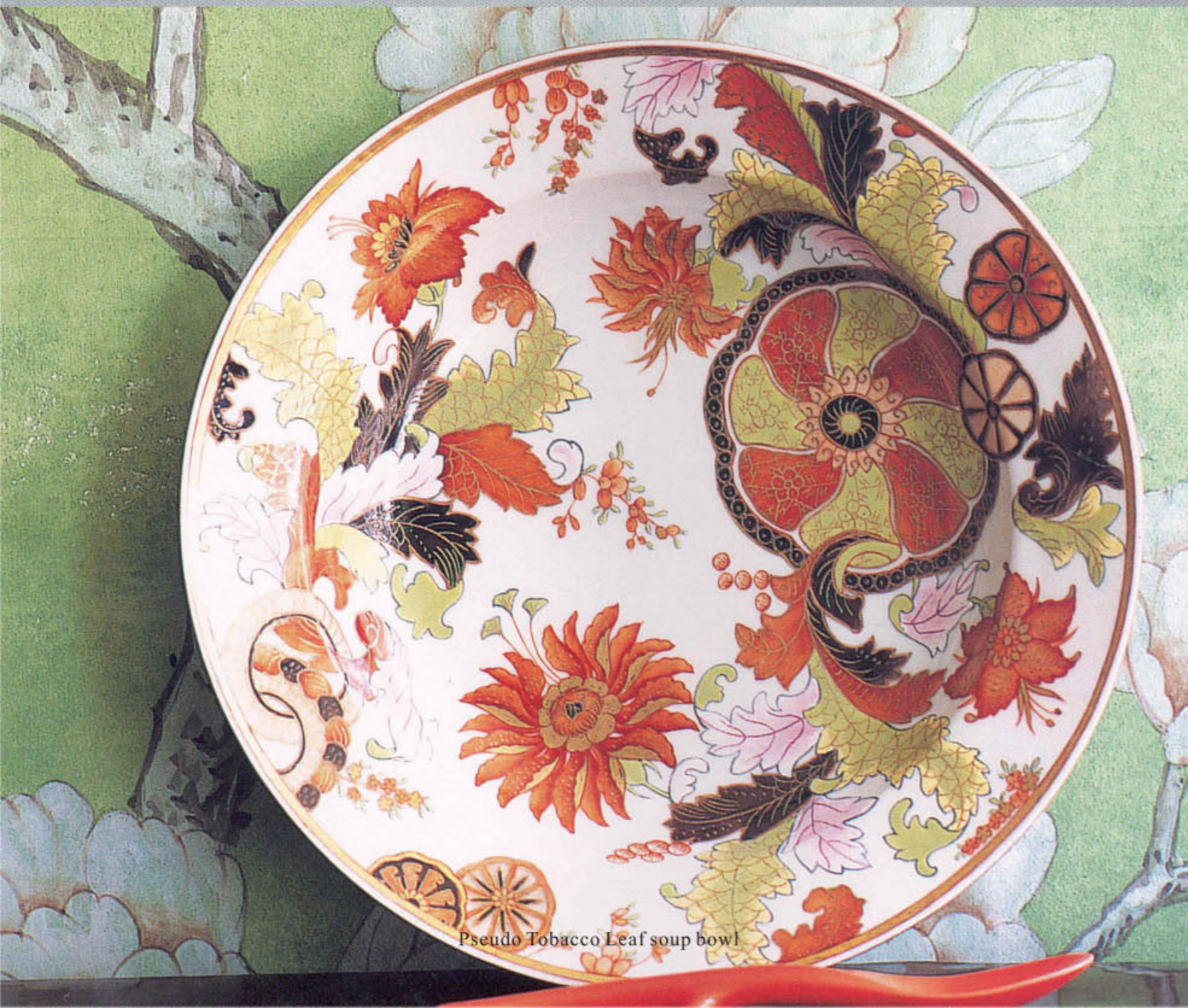
Pseudo Tobacco Leaf soup bowl