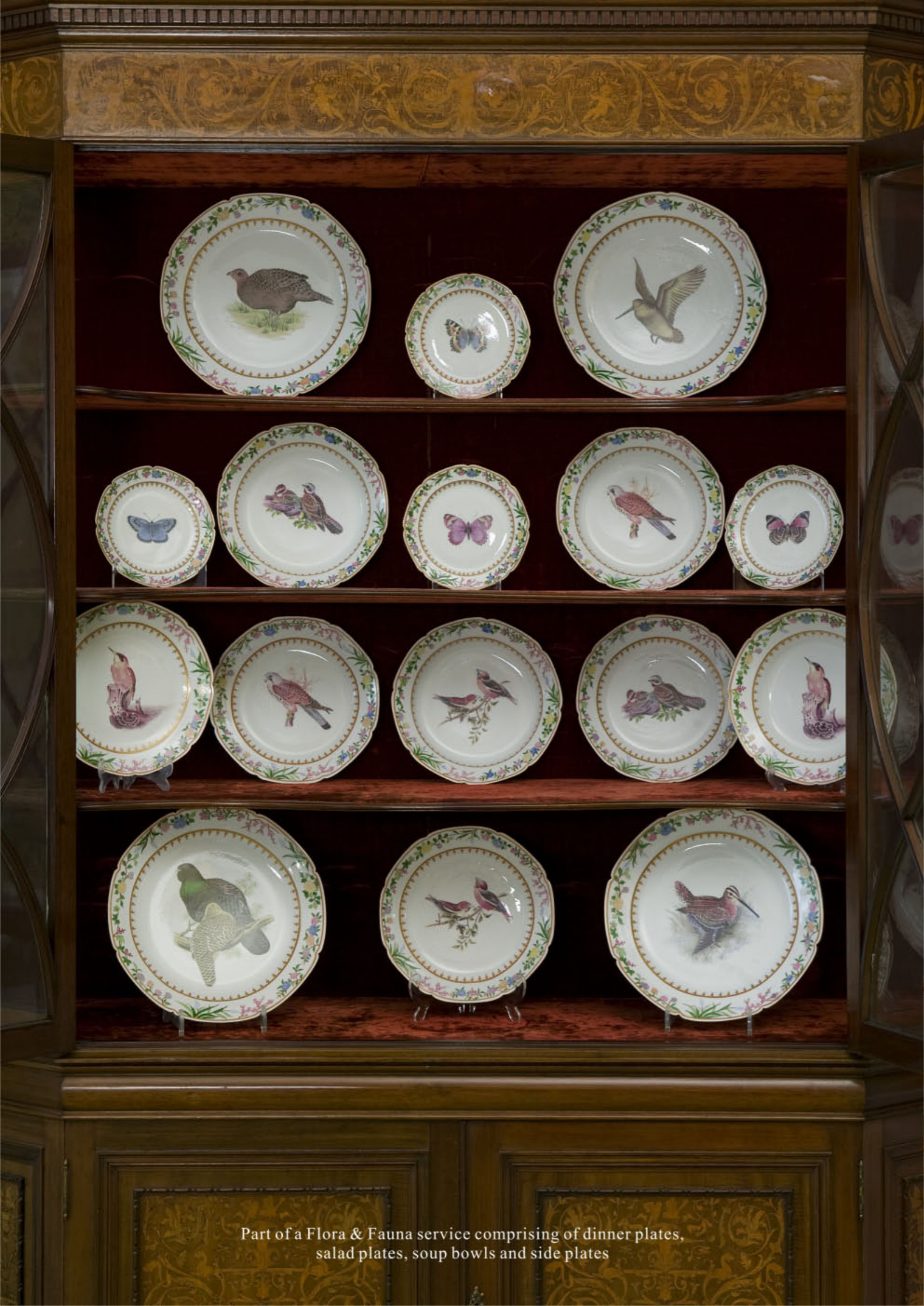
Part of a Flora & Fauna service comprising of dinner plates, salad plates, soup bowls and side plates