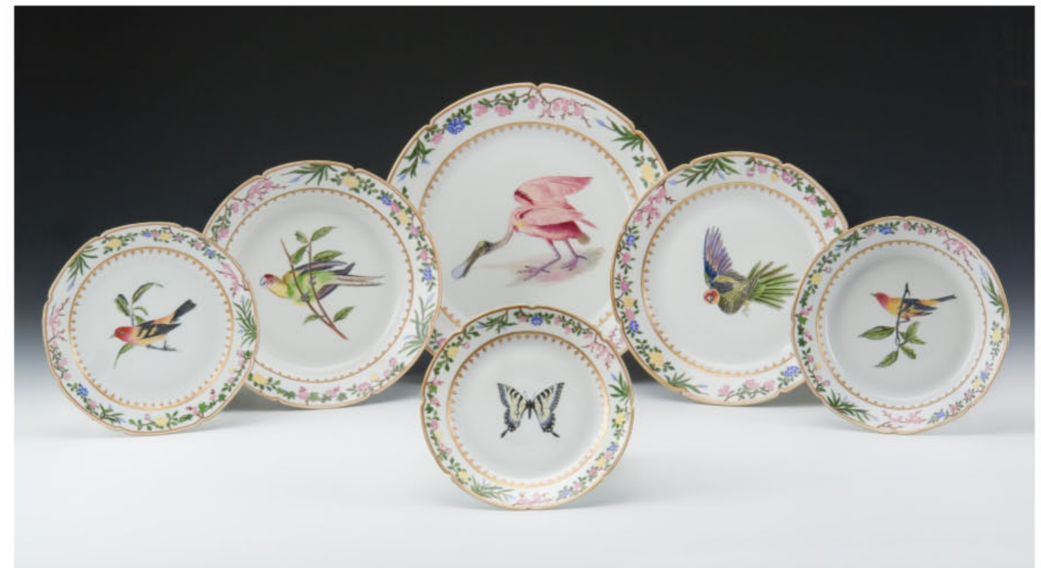
one complete flora & fauna table setting

The image below shows the actual pieces in the single setting that resulted from the design drawings illustrated opposite.