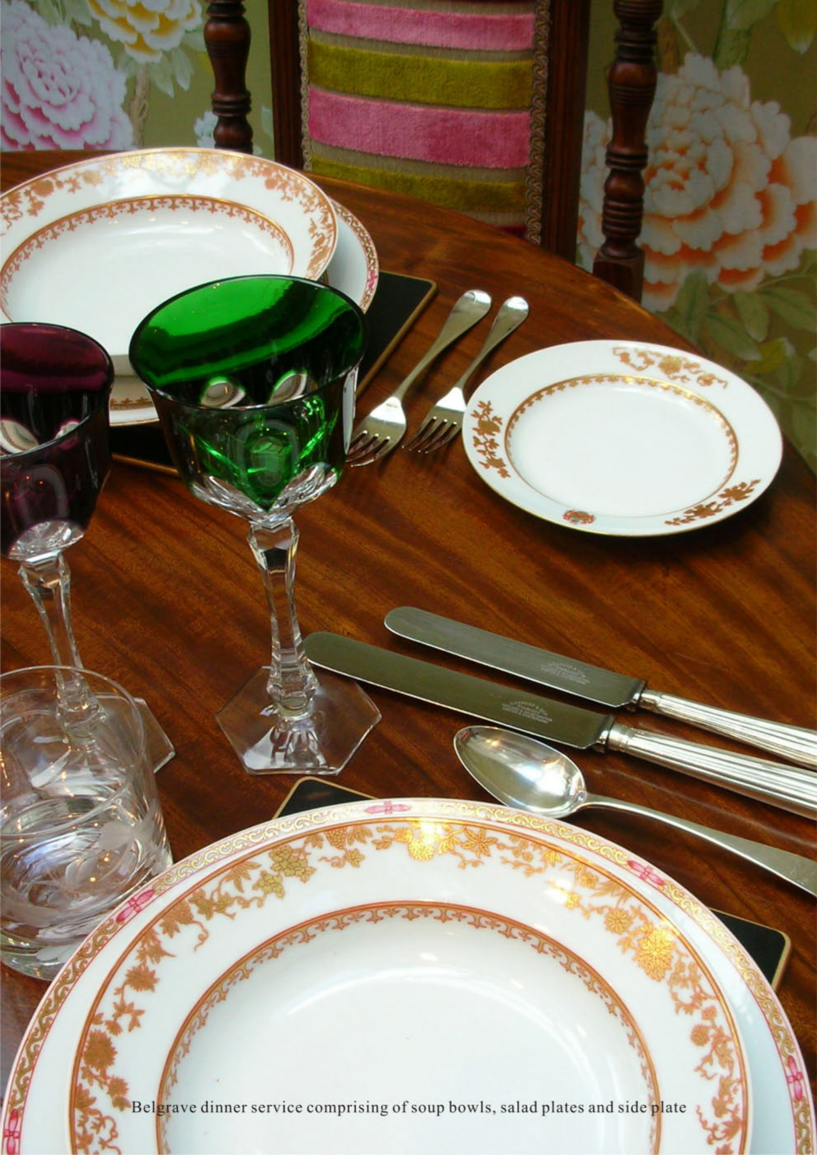
Belgrave dinner service comprising of soup bowls, salad plates and side plate